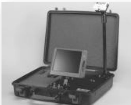
BCR-100 Briefcase Receiver